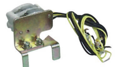
Under voltage release